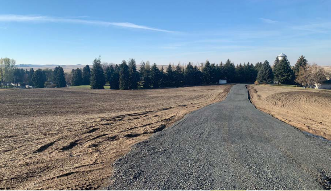
▲ Temporary road from campus to tower site.