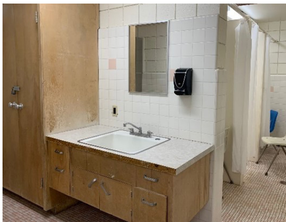
▲ Current shower room.