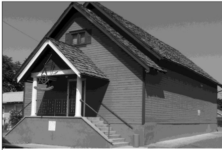
Original Grandview Church