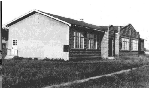
2nd Grandview Church & School